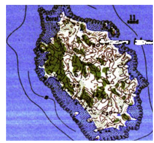
Map: Source-NAMIRA, Govt of Philippines