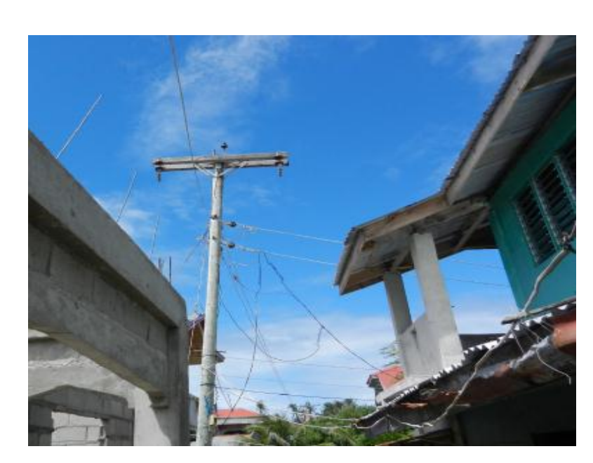
Wiring Network: making use of poles of old mini grid