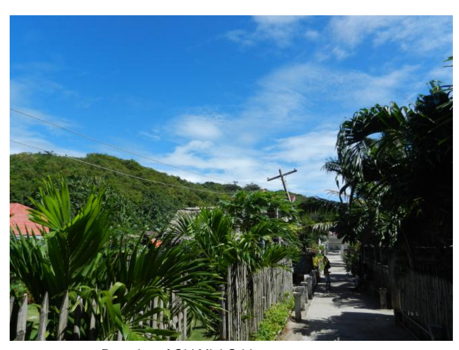
Remains of Old Mini Grid