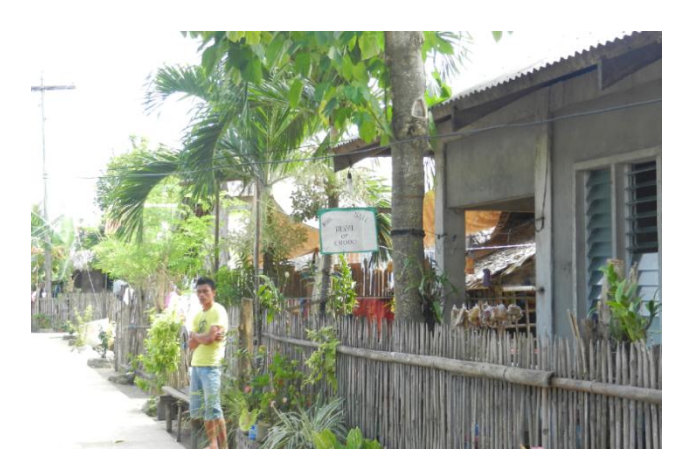
A typical wiring network around households