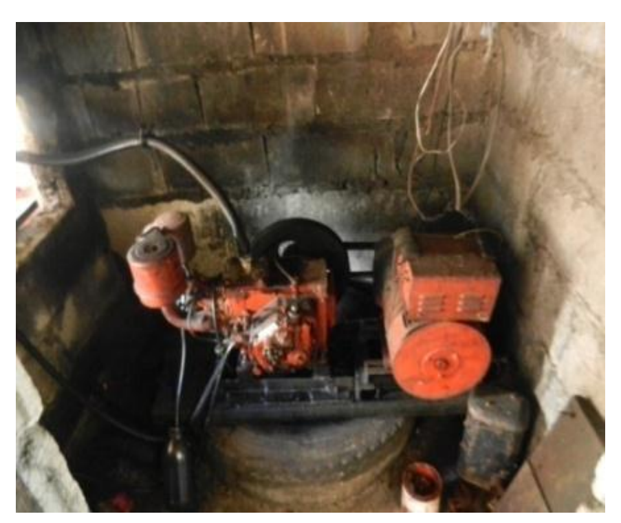
A typical Diesel Genset