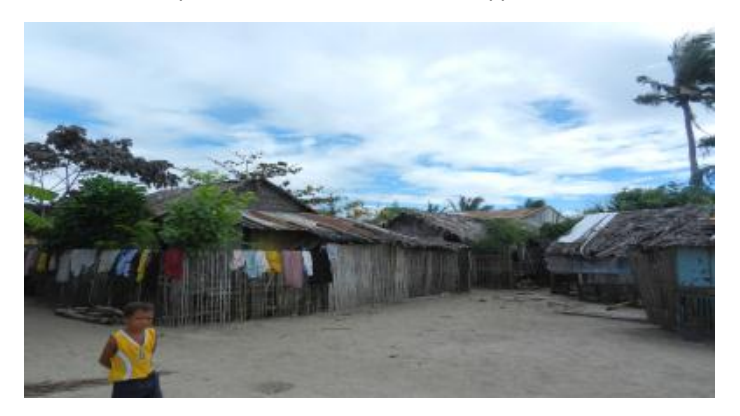
A Household cluster in the island