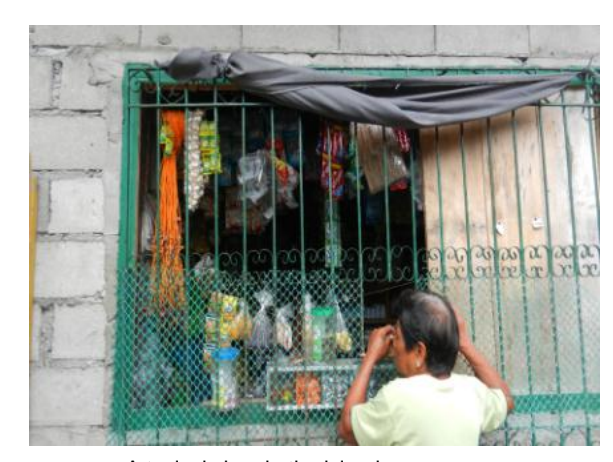
A typical shop in the island