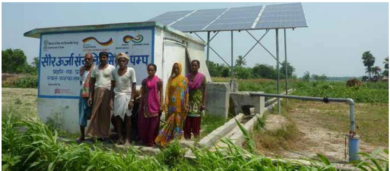
SPIS in India