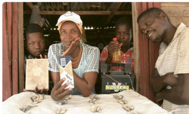
Small markets can extend their working hours in the evenings.