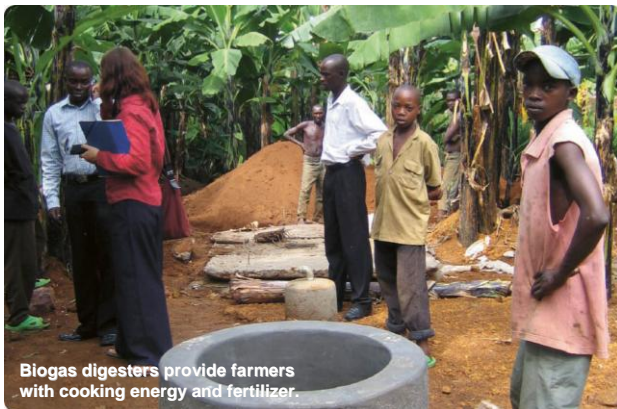
Biogas digesters provide farmers with cooking energy and fertilizer.

Activities clearly focus on those energy services and resources, which are reliable, affordable, socially acceptable and environmentally sound. EnDev initiatives should supplement ongoing activities. Hence, the core criteria for activities to be supported under EnDev relate to both quantitative output and longterm sustainability.