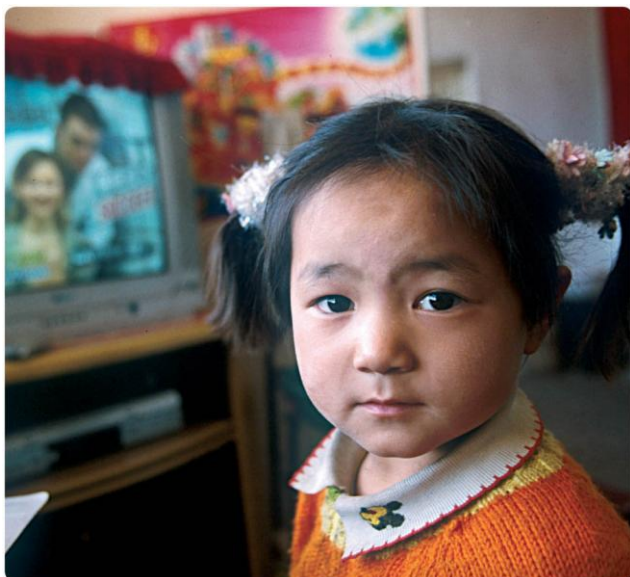
Studying in the evening and watching television is only possible with access to energy.