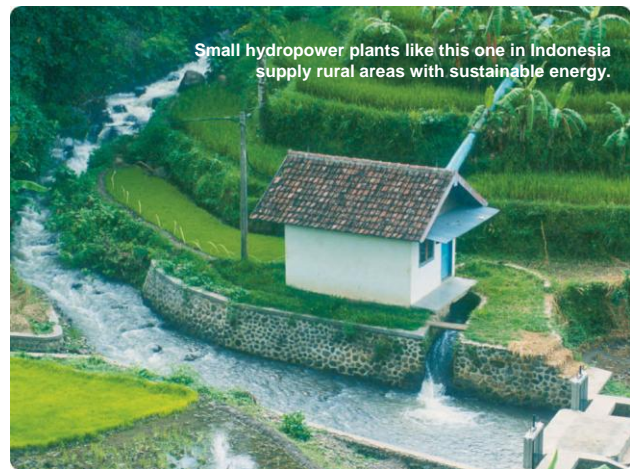
Small hydropower plants like this one in Indonesia supply rural areas with sustainable energy.

The objectives of the programme have been surpassed so far. By December 2010 more than 7.2 million people have been provided either with electricity or improved cooking technologies in households. In addition more than 30,000 social infrastructure institutions and small enterprises are benefitting from sustainable access to modern energy services.