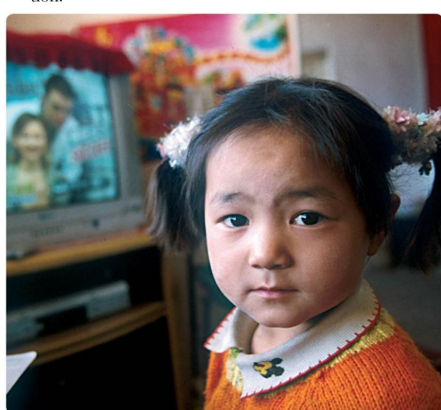
Studying in the evening and watching television is only possible with access to energy.