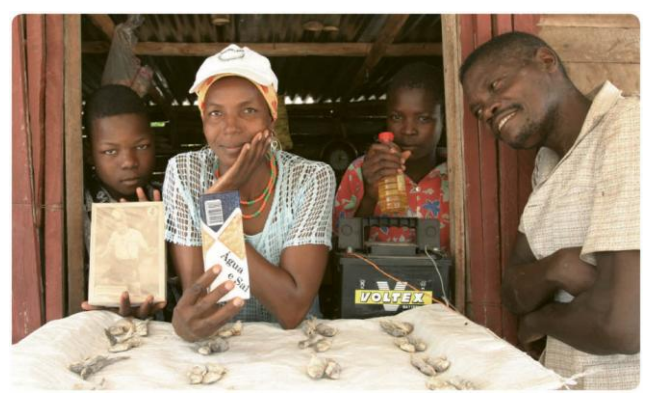
Small markets can extend their working hours in the evenings.