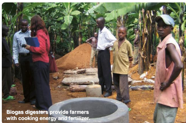
Biogas digesters provide farmers with cooking energy and fertilizer.

Activities clearly focus on those energy services and resources, which are reliable, affordable, socially acceptable and environmentally sound. EnDev initiatives should supplement ongoing activities. Hence, the core criteria for activities to be supported under EnDev relate to both quantitative output and longterm sustainability.