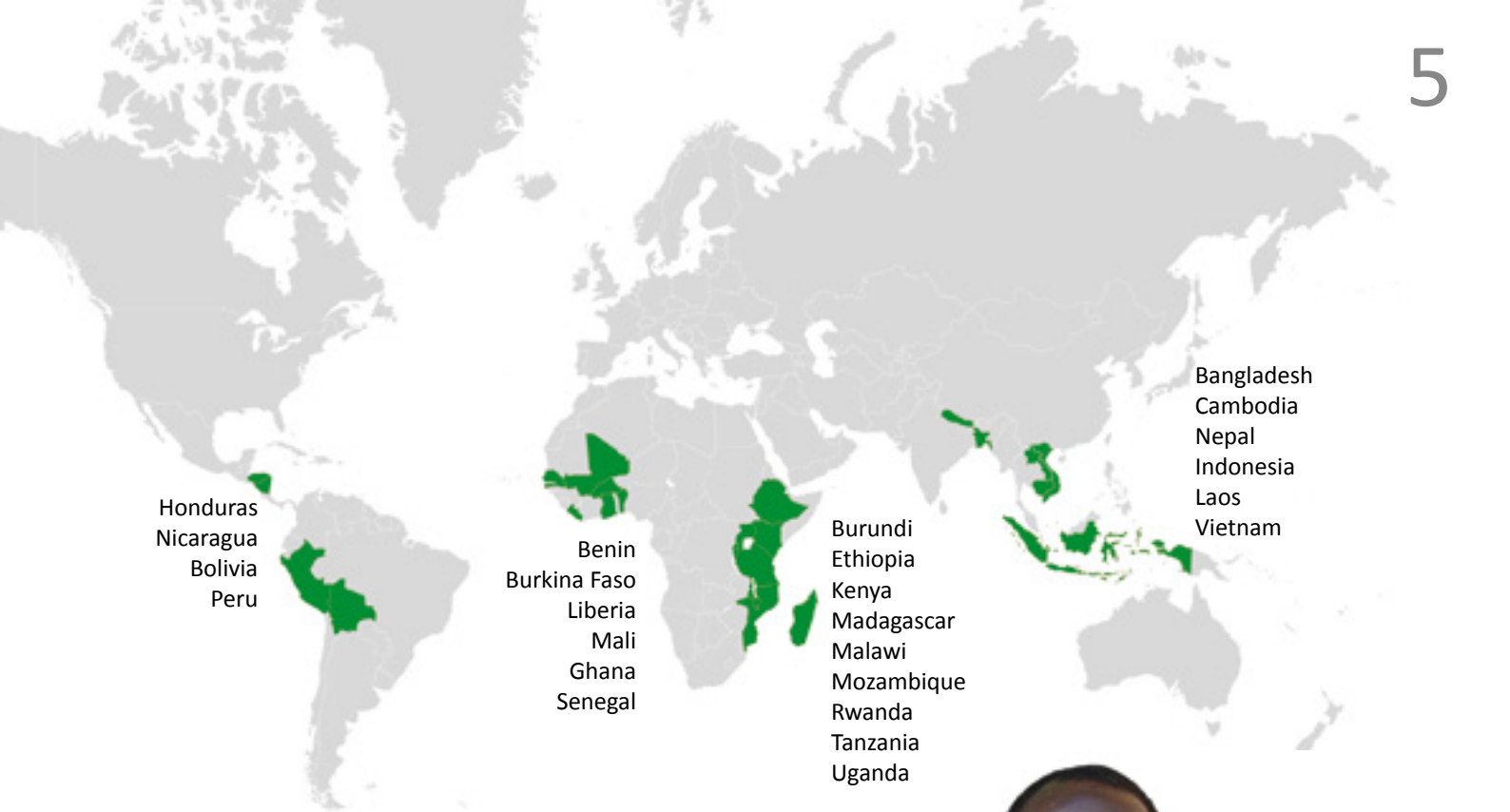
Number of households who gained access to modern energy services since 2005