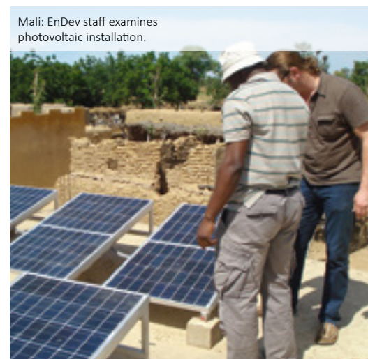
Mali: EnDev staff examines photovoltaic installation.