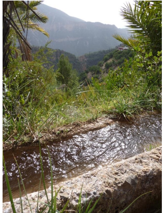
Concrete irrigation canal

The maintenance routines will influence the efficiency of operation as well as the lifetime of the SPIS. The plan can be formulated by the producer with the help of a professional service provider. This module provides examples of maintenance checklists. It is important that the maintenance activities are documented and monitored precisely.