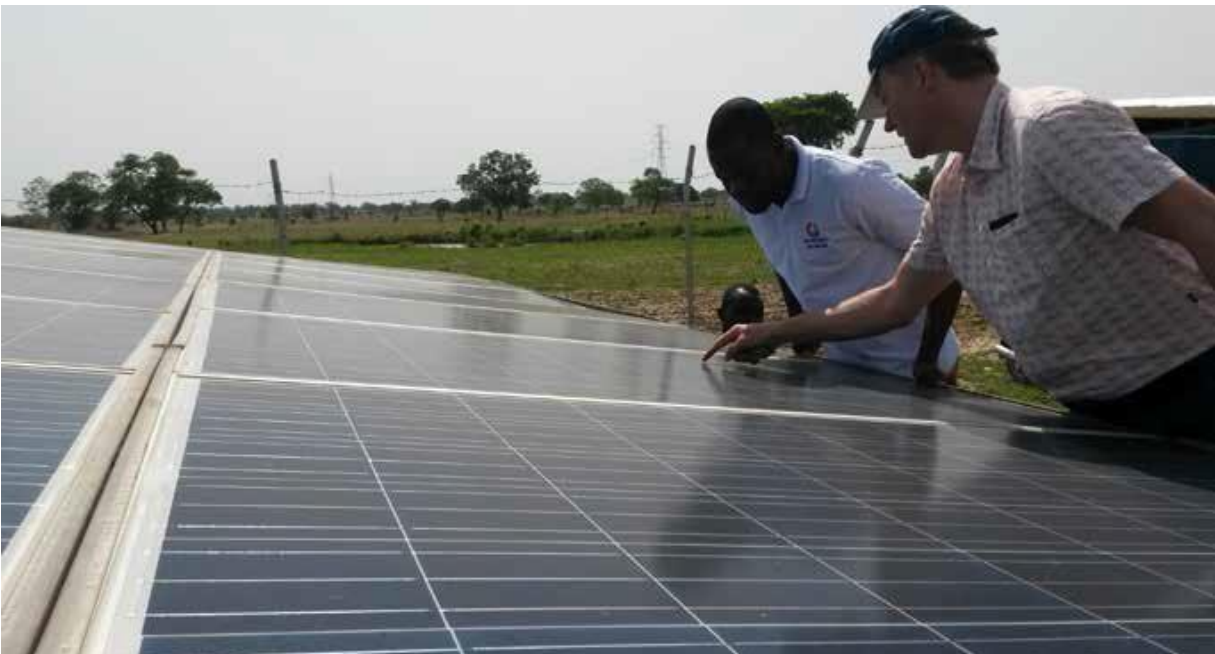
Visual check of the solar panels

Note: Hot panels should not be sprayed with cold water – they might crack!