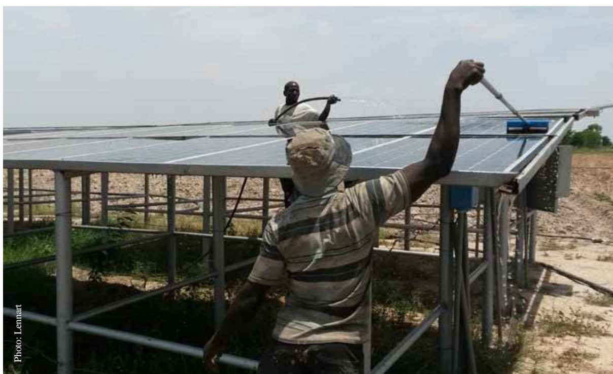
Cleaning of solar panels in Ghana as a routine maintenance activity