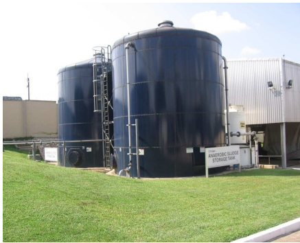
Figure 3: Effluent Treatment Plant at GGBL in Kumasi (Kaasi)

In 2005 an effluent treatment plant was installed at Kaasi. The plant produces large volumes of biogas and this gas was not utilised but rather flared for a long period. In 2012 GGBL announced the revamp of the treatment plant to improve the quality of waste-water discharged from the brewery.