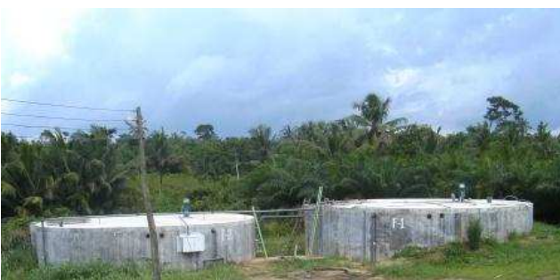
Figure 1: Biogas Plant at HPW Fresh and Dry Ltd in Adeiso 2011

HPW is one of the largest factories for dried fruits in West Africa and has a capacity of 250 Mt dried fruits per year. The factory is situated in Adeiso, Ghana, approximately 60 km northwest of Accra. HPW is processing mango, pineapple, coconut and banana, mainly for export.