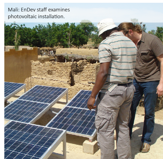
Mali: EnDev staff examines photovoltaic installation.