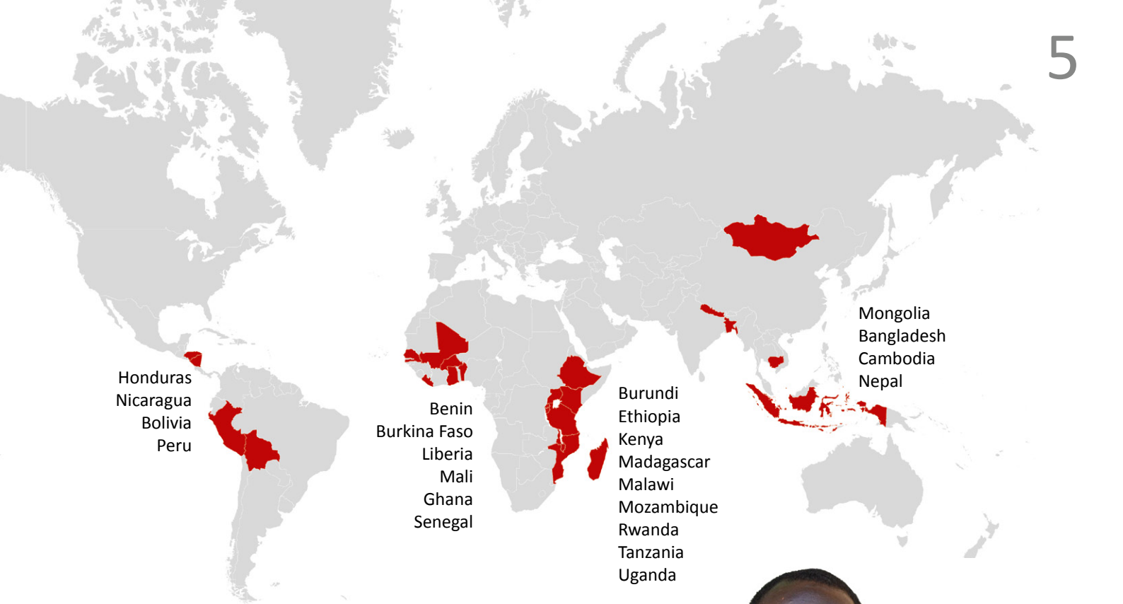
Number of households who gained access to modern energy services since 2005