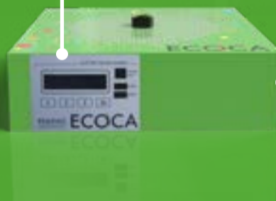
ECOCA base (614 watts) with 3 automatic cooking options