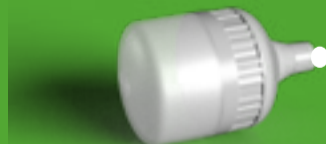
LED Lamp (3.7v 2400 mAh)