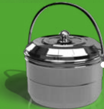
ECOCA Pot (5.8 Liters)