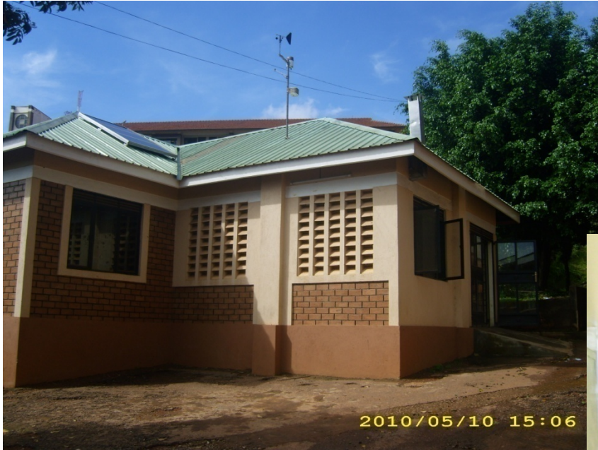
Stove Testing Service