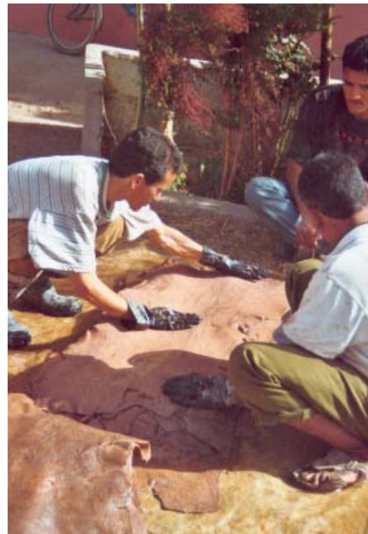
Figure 1: Small-scale leather processing in Morocco

80-90% of the world-wide tanneries use Cr (III) salts in their tanning processes. In some parts of the world, the Cr (III) is obtained from Cr (VI) species, which are a hundred times more toxic, but generally tannery effluents are unlikely to contain this form.