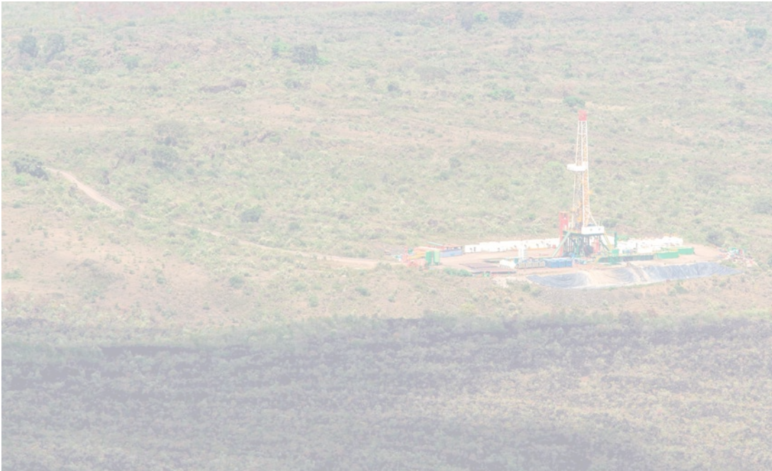
Geothermal power plant in Menengai Crater, Nakuru, Kenya