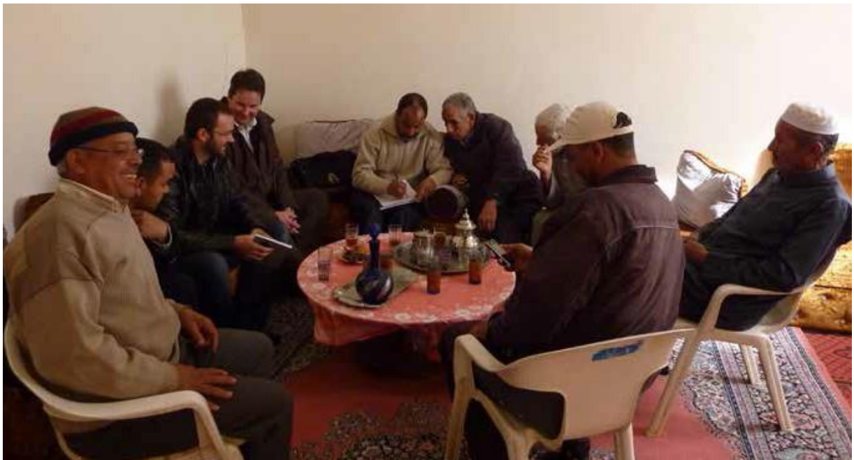
Farmer group meeting