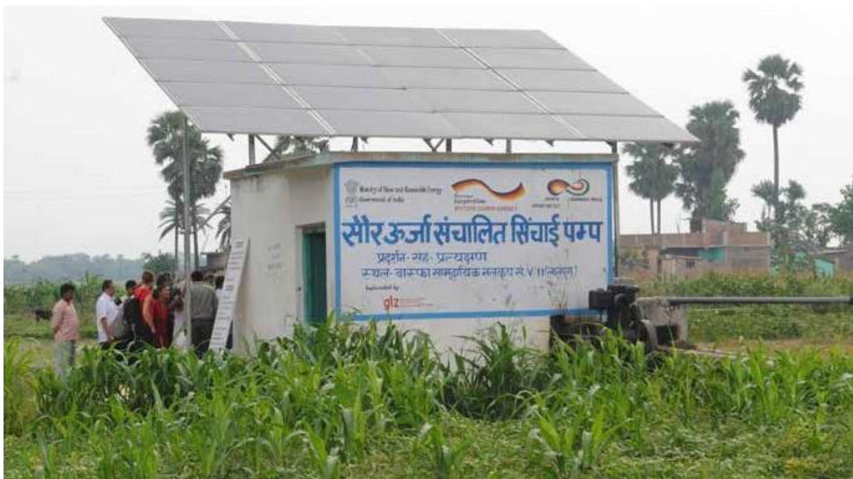
Field visit to a SPIS site in India