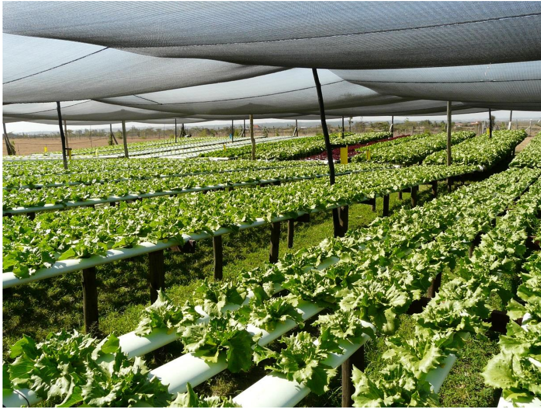
Innovative cultivation practices in irrigated farming