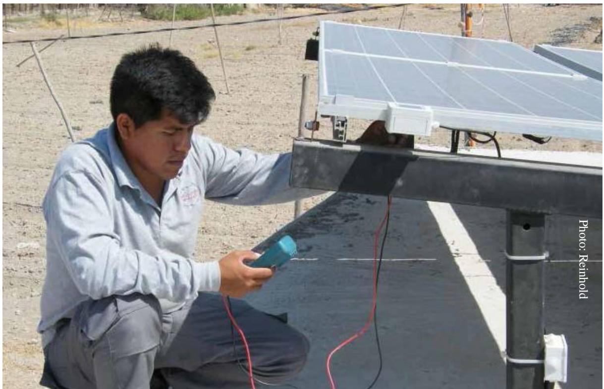
Measuring the irradiance during the Site Acceptance Test