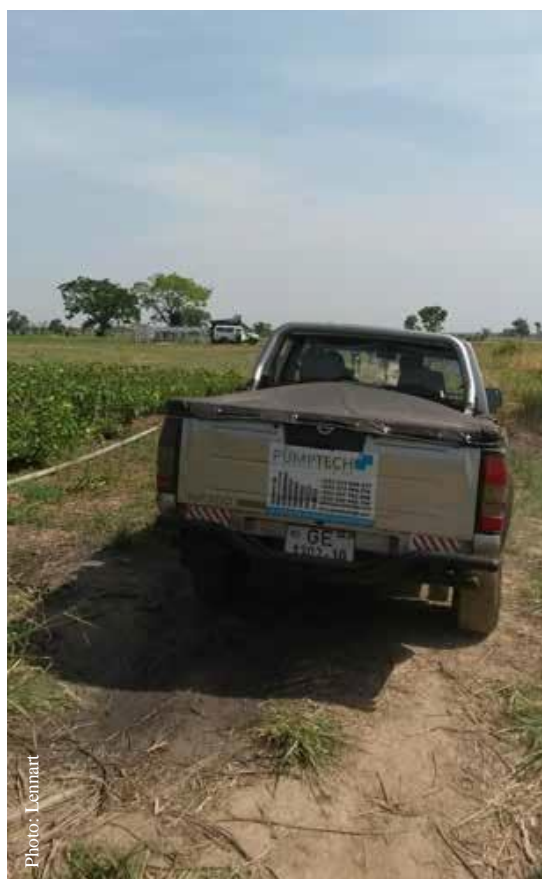
Installer visiting an SPIS site in Tamalé, Ghana