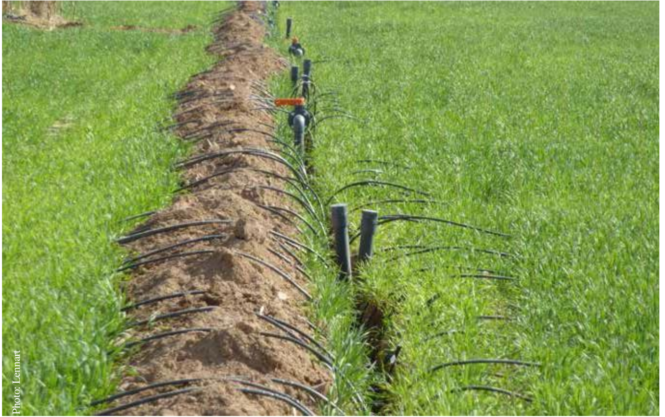
Installation of a drip irrigation system