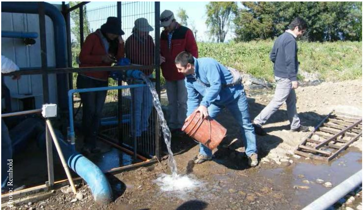
Measuring water flow