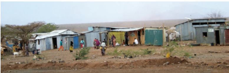
Potential customers should be located in close proximity to one another.