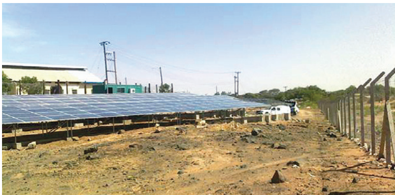
A secured mini-grid installation site.