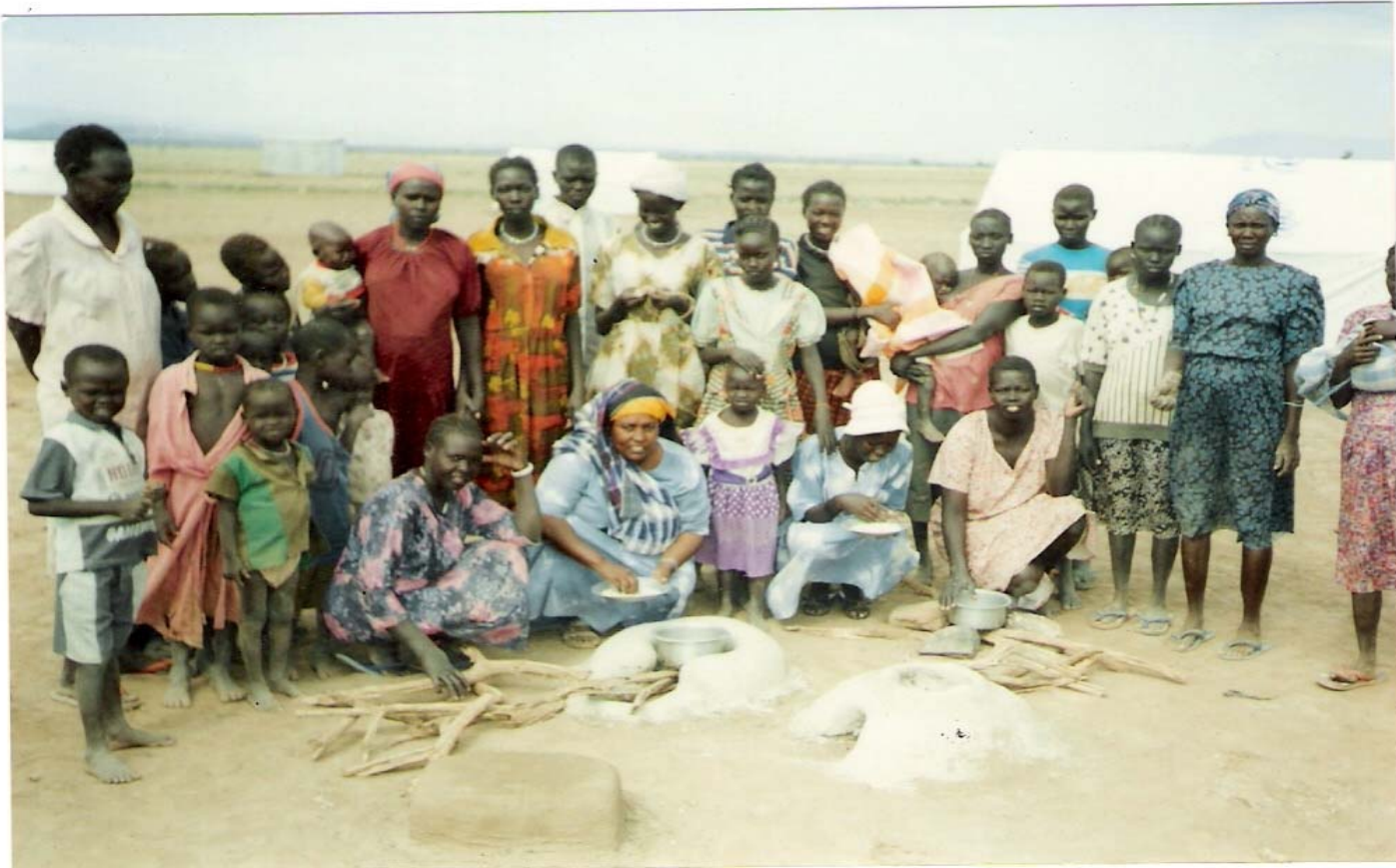
Mud stove constructed by Refugees in kakuma.