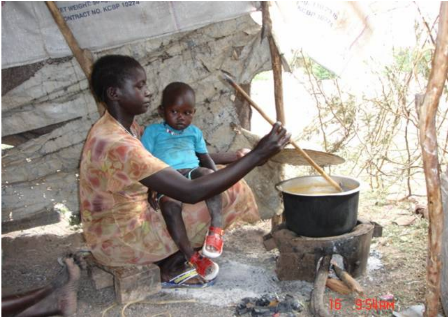
Firewood saving stove in use at household in kakuma.