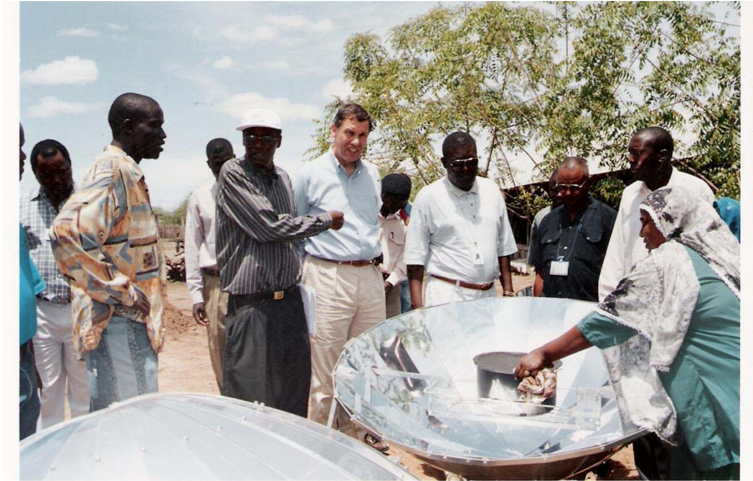
Promotion of parabolic solar cookers