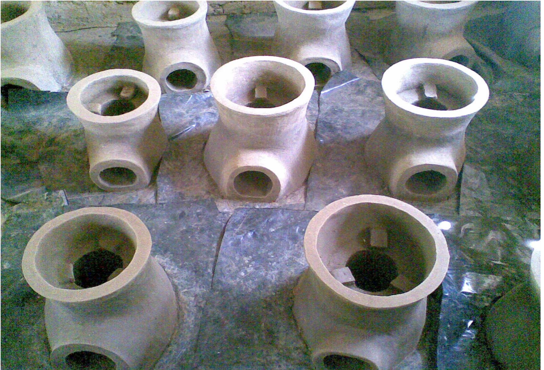
Rocket stoves ready for distribution