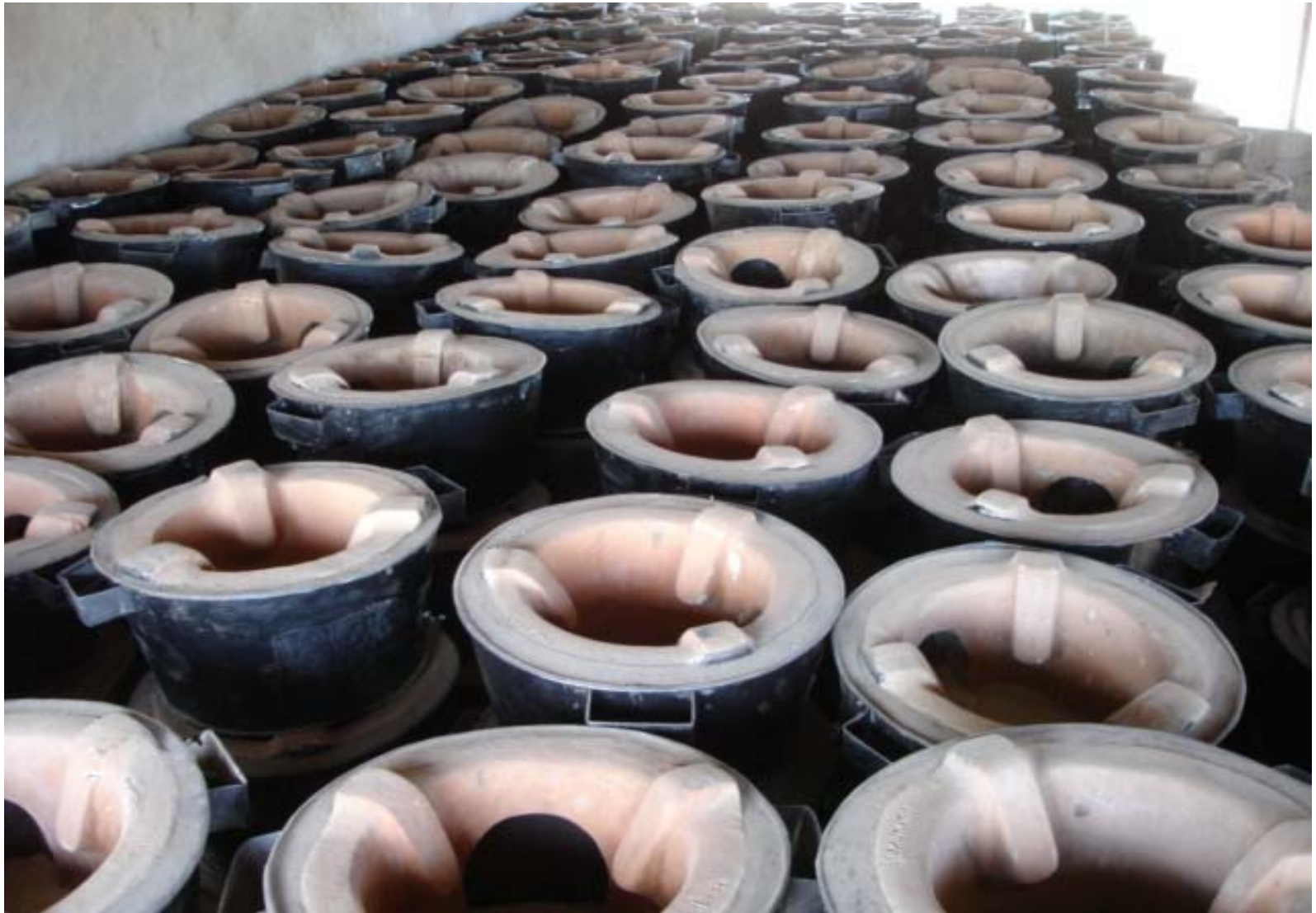
Maendeleo portable stoves ready for distribution