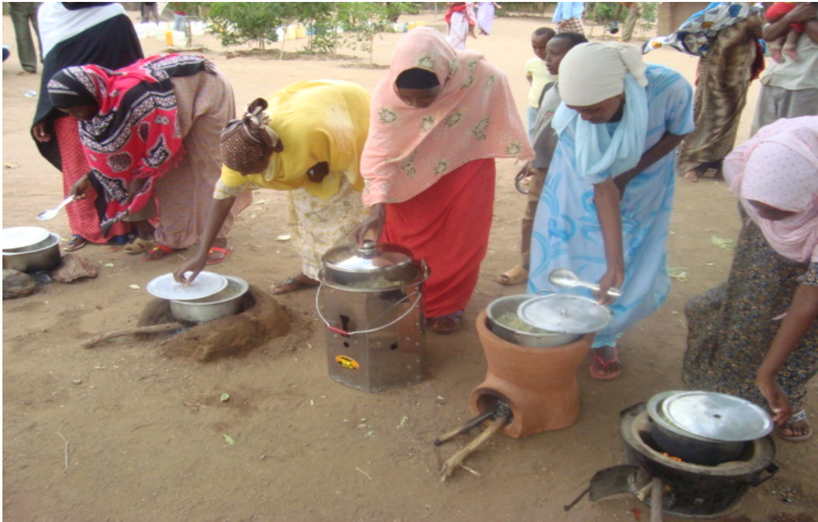
Comparative cooking demonstration of stoves.