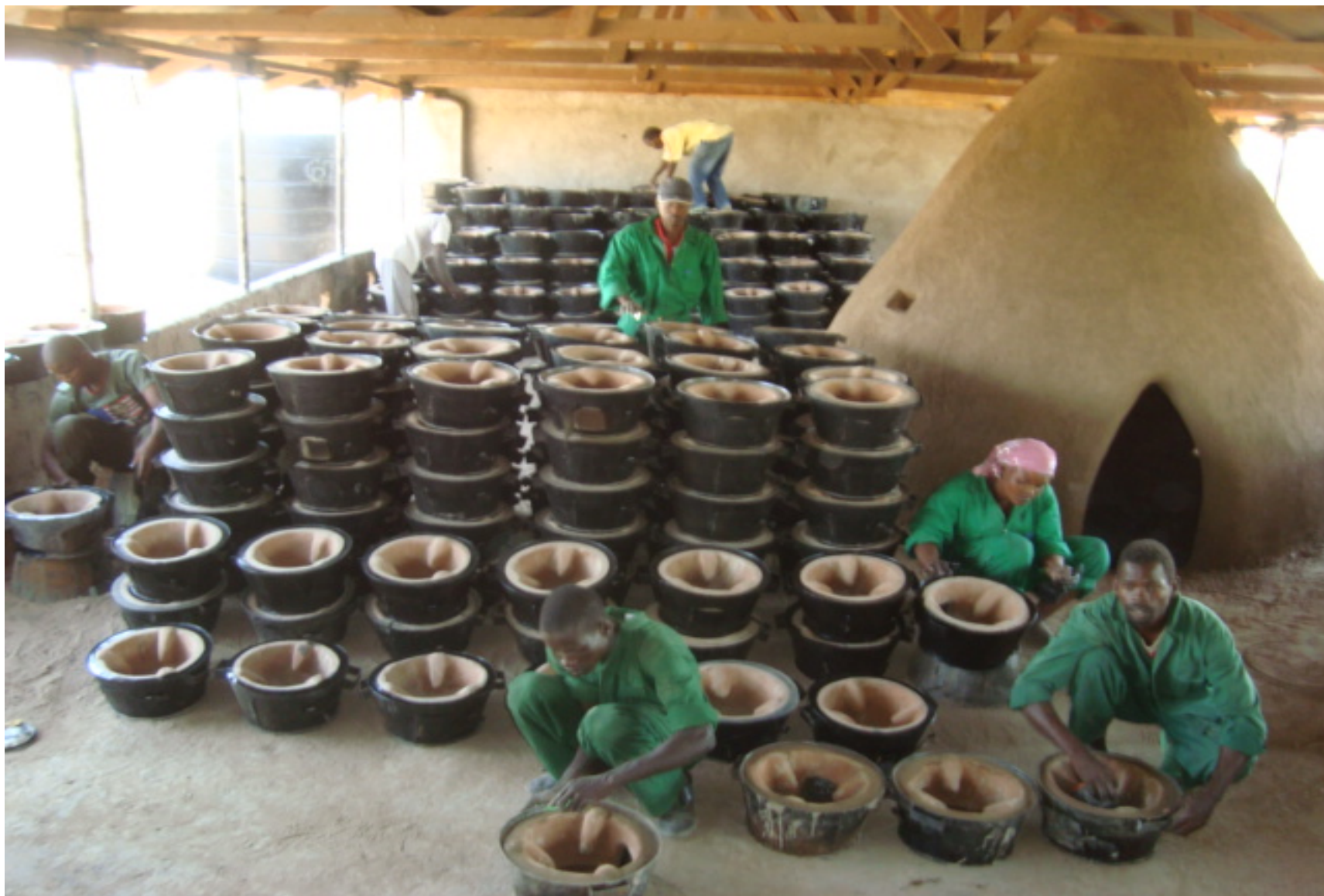
Firewood saving stoves production centre in kakuma