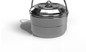
ECOCA Pot (5.8 liters)

The ECOCA is a compact, self-contained, multi-purpose home cooking unit, run by solar energy. It is to be imagined as a fully working kitchen, which can provide an entire family in a rural area with food and electricity throughout the whole day.