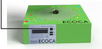
ECOCA Base (614 watts) with 3 automatic cooking options