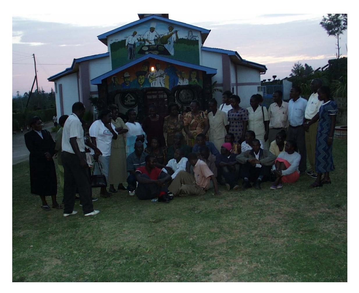
Figure 5. Western and Transmara clusters survey teams at Jamidas hotel, Kakamega