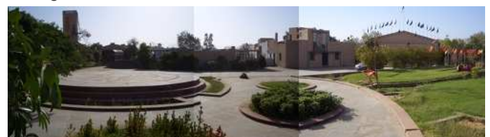
Fig. 3: Navsarjan Vocational Training Institute "Dalit Shakti Kendra" (DSK) in Nani Devti village.

The vocational training institute "Dalit Shakti Kendra" (DSK) was built on an area of 32,000 sq. meters in Nani Devti village near Sanand, about 30 km southwest of Ahmedabad City in the state of Gujarat, west of India in 1999. The institute buildings constitutes of administration, kitchen, a workshop, a hostel and a Community Training Centre. The institute is used by a variable number of students (up to approx. 240) and approx. 20 staff members (some of them living on the campus). Thus the number of people staying on the campus is approx. 260. At times, this number can significantly increase when people attending meetings and/or workshops at DSK are staying overnight.