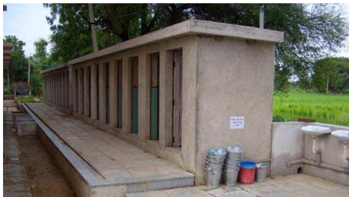
Fig. 12: View of showers installed at the hostel building, the footpath in front of the showers is used for washing clothes (source: seecon gmbh, August 2006).

2 new shower blocks comprising shower facilities (total number: 40), washbasins and laundry facilities (Fig. 13) have been constructed behind the hostel building (Fig. 12) and next to the Community Training Centre to serve people staying at the campus.