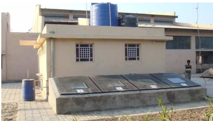
Fig. 6: View of urinal centre, the 4 urine collection tanks (in the foreground) and the storage/hygenisation tanks (atop roof) (source: seecon gmbh, January 2008).

The urinals are waterless urinals and require to be flushed 2-3 times in a day only.