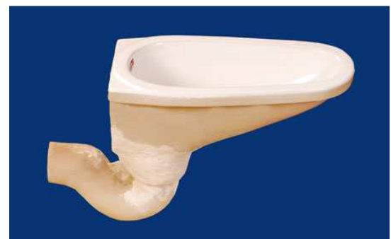
Fig. 5: Pour-flush squatting pan ("rural pan") and water seal ("P-trap") (supplier: Shital Ceramics, India).

In these toilet cabins, pour-flush squatting pans (so-called "rural" or "pour-flush" pans) made of ceramics were installed which are equipped with a water seal (Fig. 5) and are supplied by the Indian company Shital Ceramics.