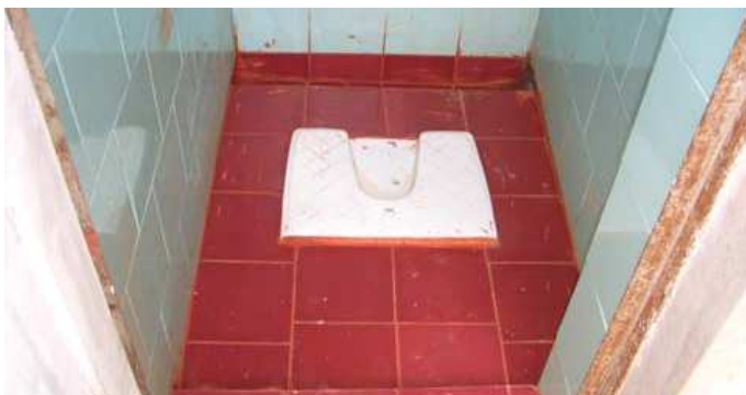
Fig. 7: View of ladies squatting urinals (source: seecon gmbh, August 2006) supplier Shital

There are separate urinals for women (Fig. 7). The urine is drained through the drain channel at the edge of the room and collected in the tanks.