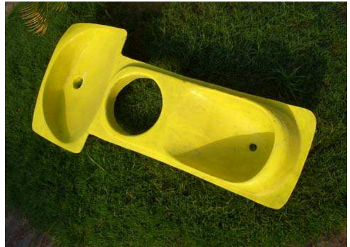
Fig. 17: Urine-diversion squatting pan that allows separate collection of urine, faeces and anal washwatersupplier – Aries.

The overall design of the UDDTs (implemented as Single Chamber Urine-Diversion Dehydration Toilets) and the shallow cleansing water collection bowl (see Fig. 18), which resulted in spilling of the anal washwater into the faeces hole (the anal washwater section on the left of the pan was found to be too small). Also as the anal washing was located just behind the faeces hole, it was visually discomforting for the users during anal cleansing. This reasons led to closing-down of the toilets. It is therefore preferable to separate the anal cleansing from the pan.