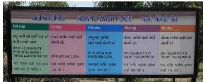
Fig. 9: Newly designed instruction board on "How To Wash Plates" (fixed above the dishwashing stall) (source: seecon gmbh, October 2009).

This has proved to be better as biowaste does not clog the filters.