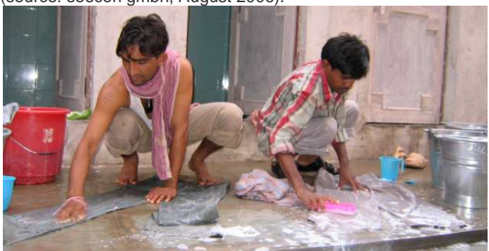
Fig. 13: Students washing clothes in front of the showers.

Greywater collected from the showers and laundry area at the hostel is discharged to elevated greywater gardens (Fig. 15) for infiltration. They are elevated to prevent flooding by surface water during monsoon season. Any surplus of water that does not infiltrate into the soil is collected in a tank and is reused for irrigation purposes during dry periods.