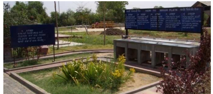
Fig. 8: View of new stand for washing dishes.

A new stall for dishwashing (Fig. 8) was built. It was planned to lead the dishwashing stall effluent via a vertical flow organic filter (filter material: rice husk) to a storage tank.