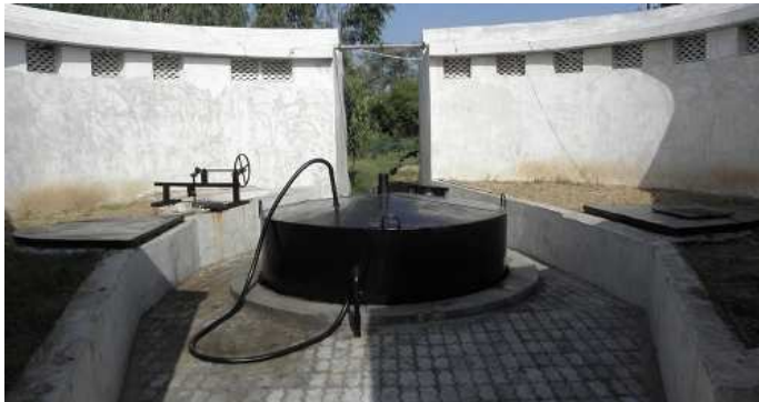
Fig. 15: View of floating drum-type biogas plant (with water jacket) for treatment of blackwater.

Because of the high groundwater table during monsoon season the local engineer proposed construction of the biogas plant to be done in reinforced cement concrete instead of brickwork. To prevent buoyancy of the biogas plant, the thickness of the base has been increased to 45 cm and the base protrudes the outer diameter of the cylindrical shaped digester body by 50 cm. At an inner diameter of 2.75 m and a clear height of 4.55 meters (approx. 25 cm less than shown in the technical drawings) the net digester volume is approx. 27 m 3 .