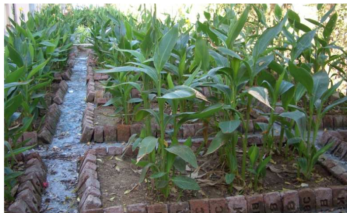
Fig. 14: Elevated gardens for the infiltration of greywater

Greywater collected from the showers and laundry area at the hostel is discharged to elevated greywater gardens (Fig. 15) for infiltration. They are elevated to prevent flooding by surface water during monsoon season. Any surplus of water that does not infiltrate into the soil is collected in a tank and is reused for irrigation purposes during dry periods.