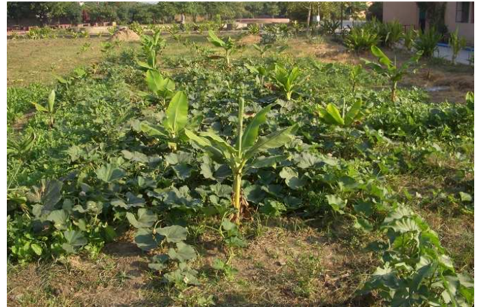
Fig. 16: One out of many small gardens used for growing vegetables (e.g. spinach, brinjals, etc.) and fruits at DSK campus (e.g. bananas).