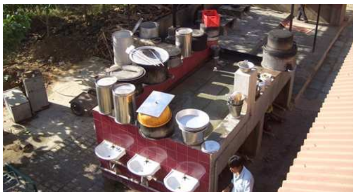
Fig. 11: View of new stand for washing utensils at outdoor kitchen area (source: seecon gmbh, March 2009)

In addition to the dishwashing stall a stall for washing kitchen utensils (Fig. 11) was built. The effluent from this stall was (after being treated in a vertical flow organic filter to retain solid matter) was directly applied in irrigation of nearby bushes and trees.. However, after a few months a short sewer was laid and the water is drained to the tank that also receives the effluent from the dishwashing stall. Biowaste from the kitchen utensils is cleaned with ash before washing them and the spent ash is cocomposted (Fig.11). The water is then supplied for irrigation by a solar panel operated pump