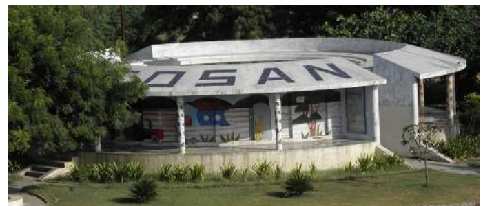
Fig. 4: New sanitation complex with 22 pour-flush toilets and biogas plant built in 2006.

A new and conveniently located (75m from Community Training Centre and less than 75m from the Hostel) common sanitation complex was built for the approx. 250 people staying on the campus on an average. The sanitation complex consists of 22 toilet cabins (11 for females and 11 for males) arranged in a circular shape around a biogas plant located in the center (Fig. 4).