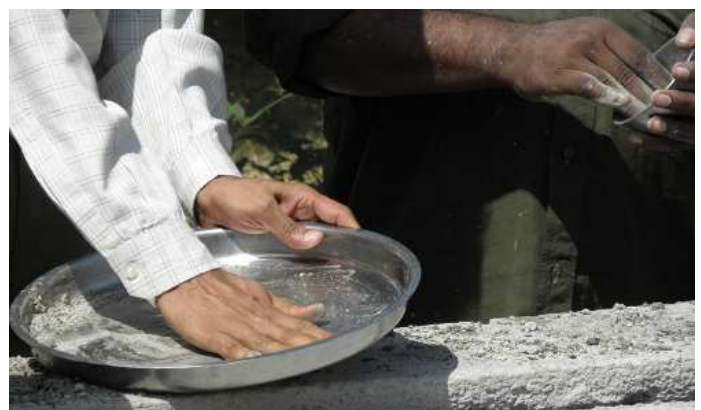
Fig. 10: 1 st step of cleaning plates: removing grease/oil by wiping out plates/utensils with wood ash.