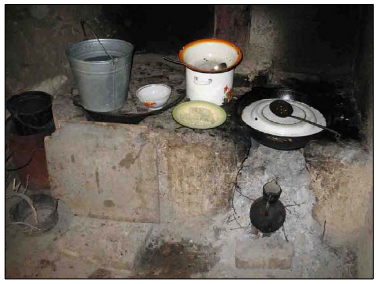
The traditional wood fired stoves are unsuitable for comparative testing

Chopping the vegetables small in the traditional cooking pot would have tenderized them earlier, but the traditional dish included the meat. The long cooking process also guaranteed adequately the stewing of the meat. Besides, if one is traditionally used to big chunks of meat and vegetables, you would not appreciate mini cubes in the soup.