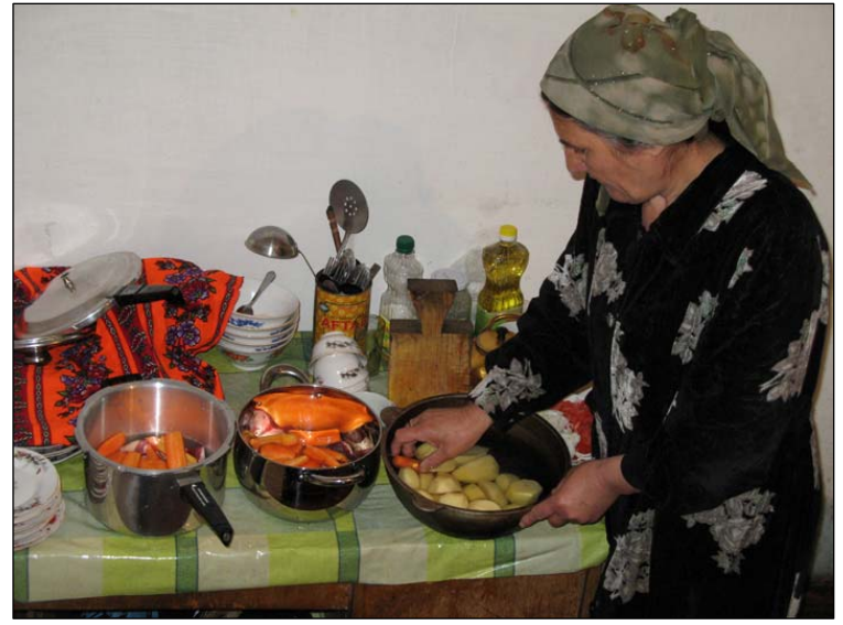
The cook prepares equal portions of the ingredients in the two pots.

The pressure cooker is essential in the <u>higher altitudes</u>, because it creates a higher boiling temperature due to the steam pressure inside the cooking pot. The higher the altitude, the lower will be the atmospheric pressure and the related natural boiling temperature and hence, the longer it will take for food to cook, and more efficient becomes the pressure cooker. Several types of pressure cookers can have about 100kPa pressure increase over local atmospheric pressure, but models vary greatly. The required boiling time for softening the food is between 1/4<sup>th</sup> and 1/5<sup>th</sup>