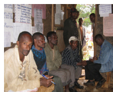
Cooperative board members