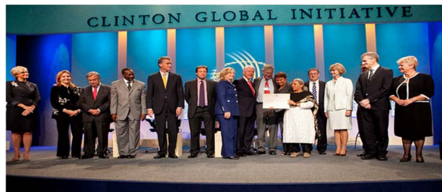
Launch of Global Alliance of Clean Cookstoves