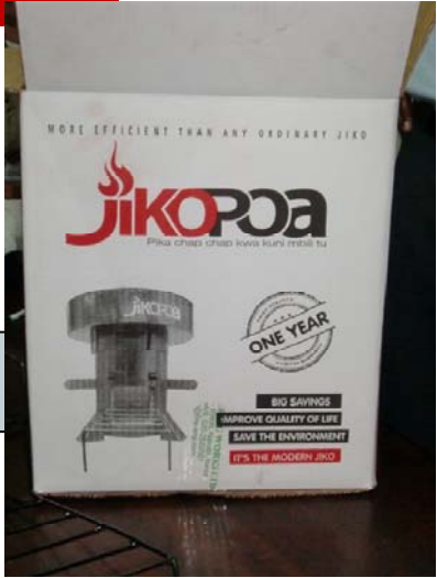
JiikoPoa Production in Kenya