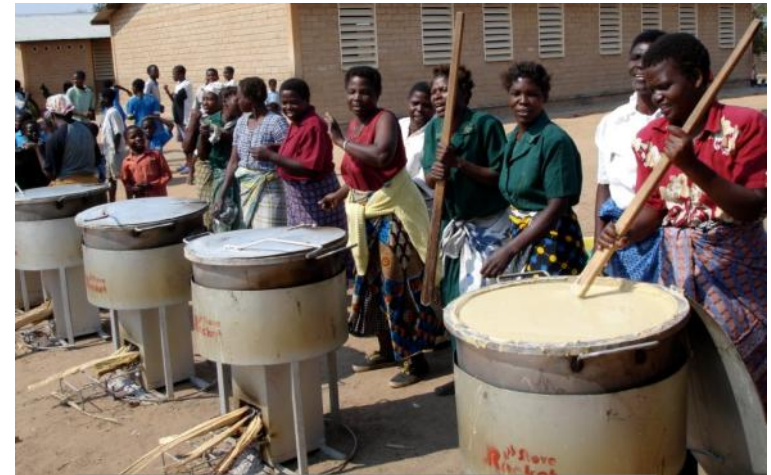
Rocket Stove in Malawi