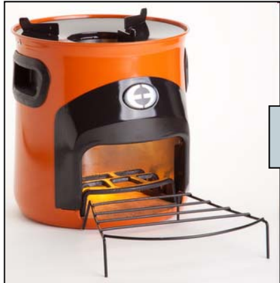
EnviroFit/Shell Foundation wood stove