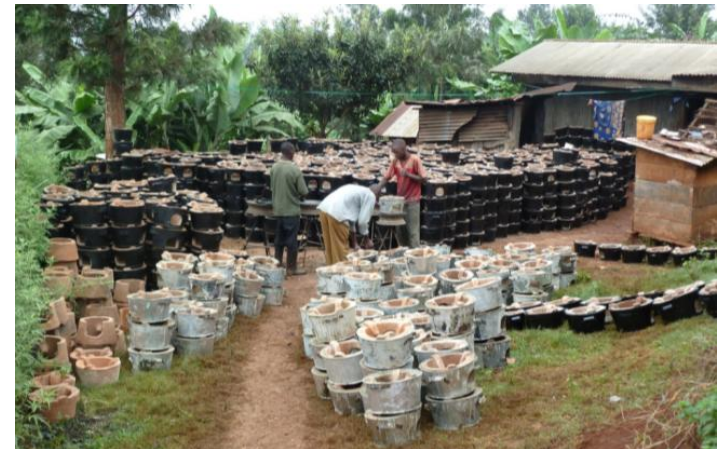
Stove Production in Ethiopia and Kenya