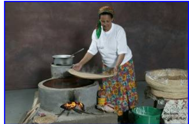
Injera Baking in Ethiopia – traditional and improved